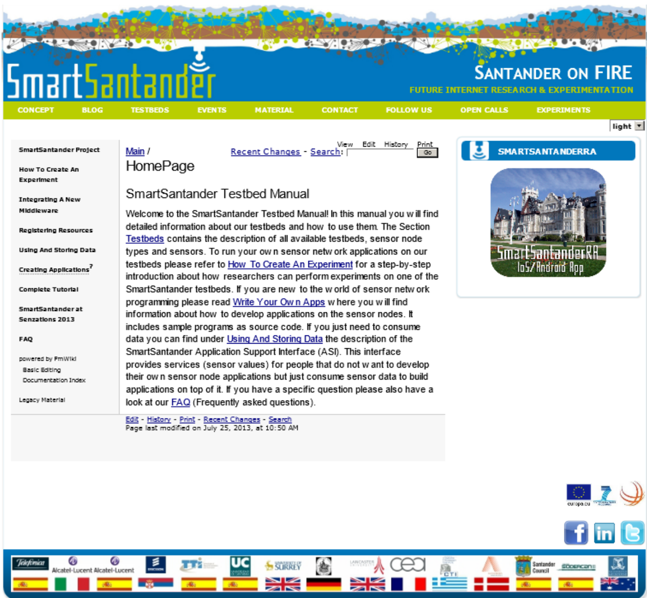
Figure 2 Screenshot of http://www.smartsantander.eu/index.php/wiki

The following figure shows a screenshot of the home page of the final testbed manual: